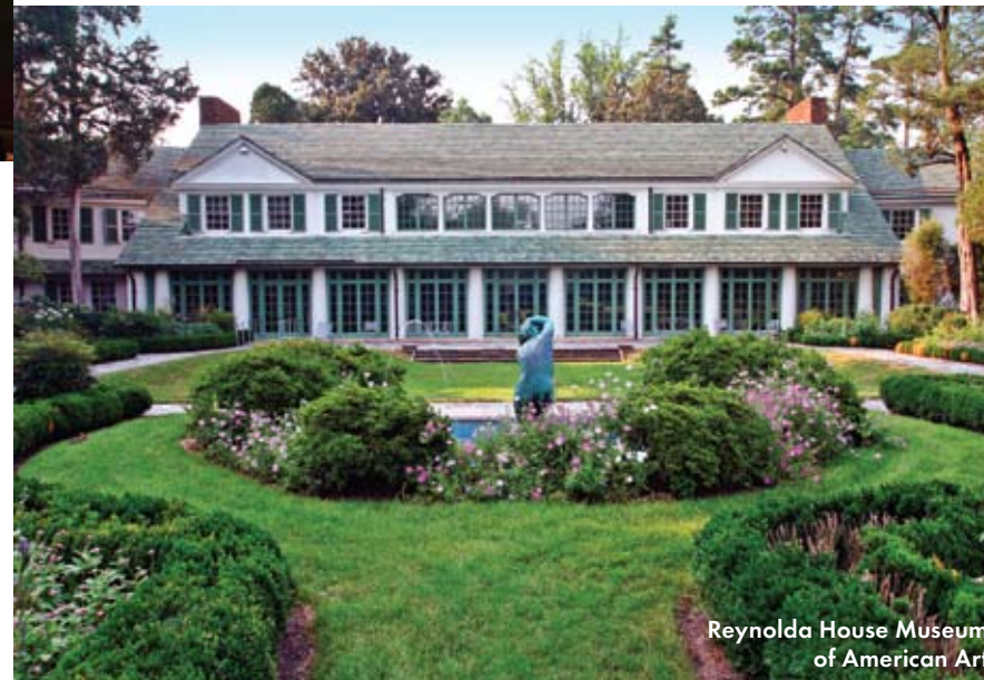
Reynolda House Museum of American Art

Best Culture Catch a glimpse of the past along the historic Reynolda Mile. Several founding families' homes have been converted into notable art museums, including the residence of tobacco titan R. J. Reynolds, now the Reynolda House Museum of American Art ( reynoldahouse.org ), and the former Hanes mansion, home to the Southeastern Center for Contemporary Art. secca.org